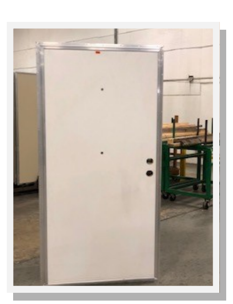
Vinyl Steel Core