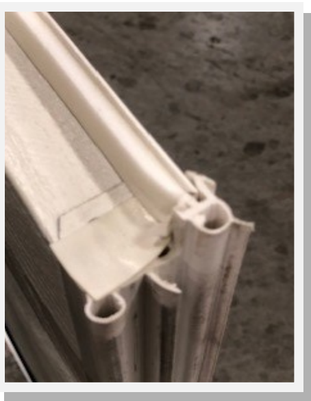
Vinyl Door Sweep