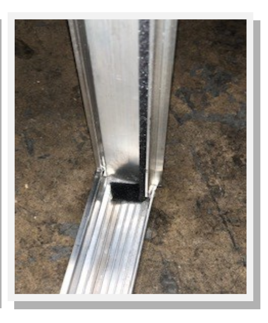
ADA Compliant Handicap